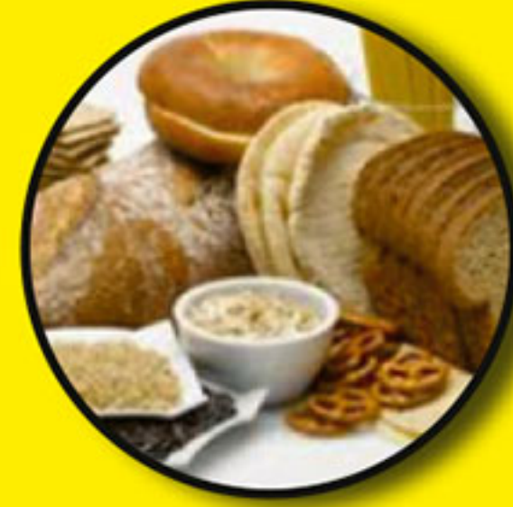
Cereals containing Gluten